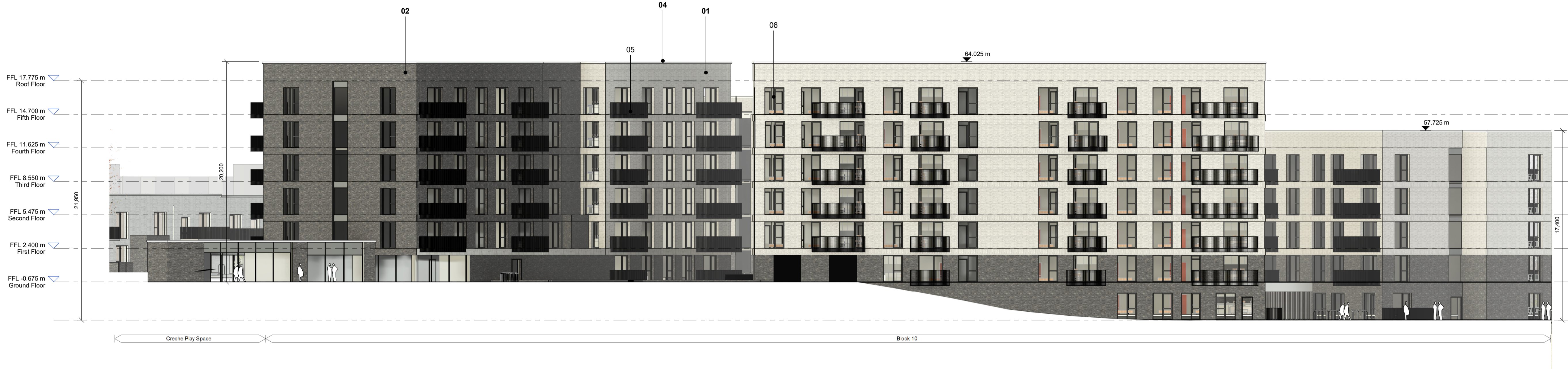
East Elevation 1 : 200