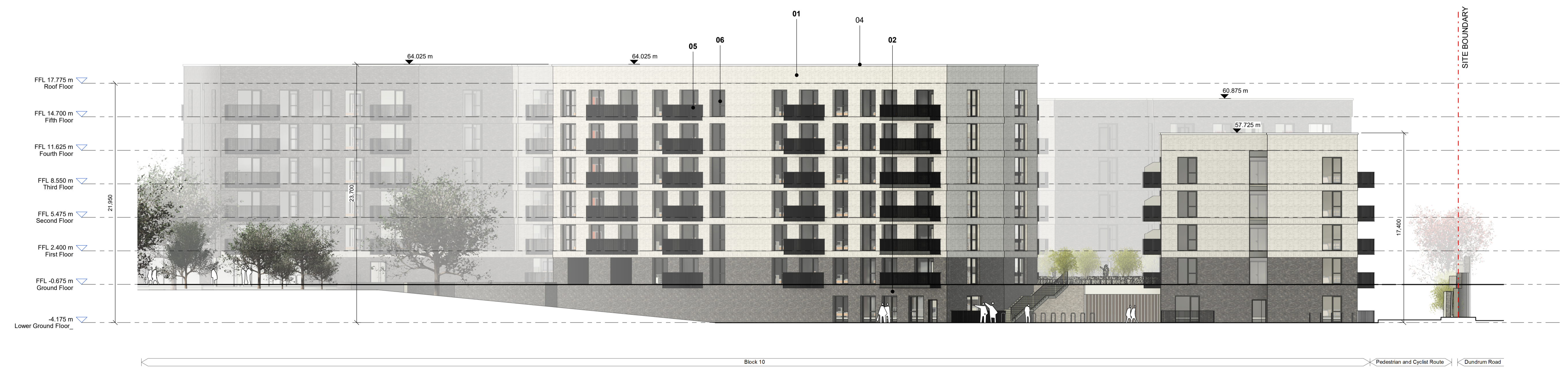
North Elevation 1 : 200

Notes: - Do not scale from this drawing. Use figured dimensions in all cases. - Verify dimensions on site and report any discrepancies to the Architect immediately. - This drawing is to be read in conjunction with the Architect's Specification. - © This drawing is copyright and may only be reproduced with the Architect's permission.